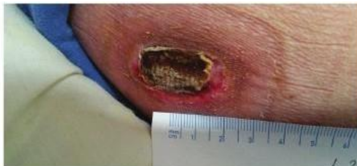
Right Hip wound, 24.2.16