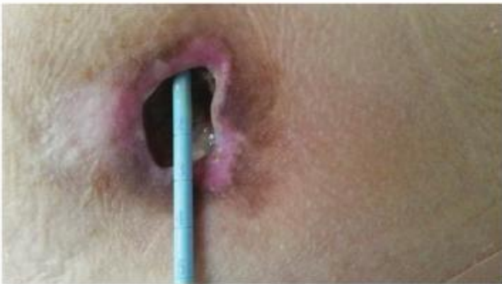
Above picture taken 17/12/15, right hip